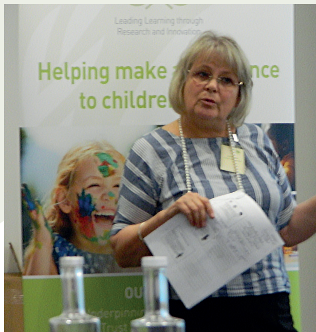
Sharing our Research

“The implementation of ETB has been extremely successful and has mirrored the impact of previous ICAN research.”